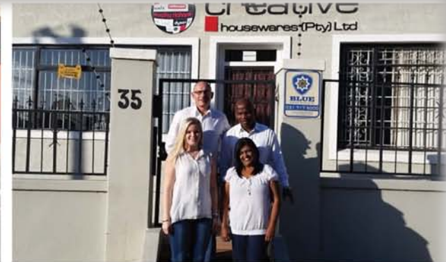
DURBAN - SOUTH AFRICA