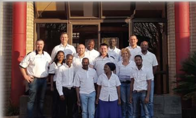
JOHANNESBURG - SOUTH AFRICA